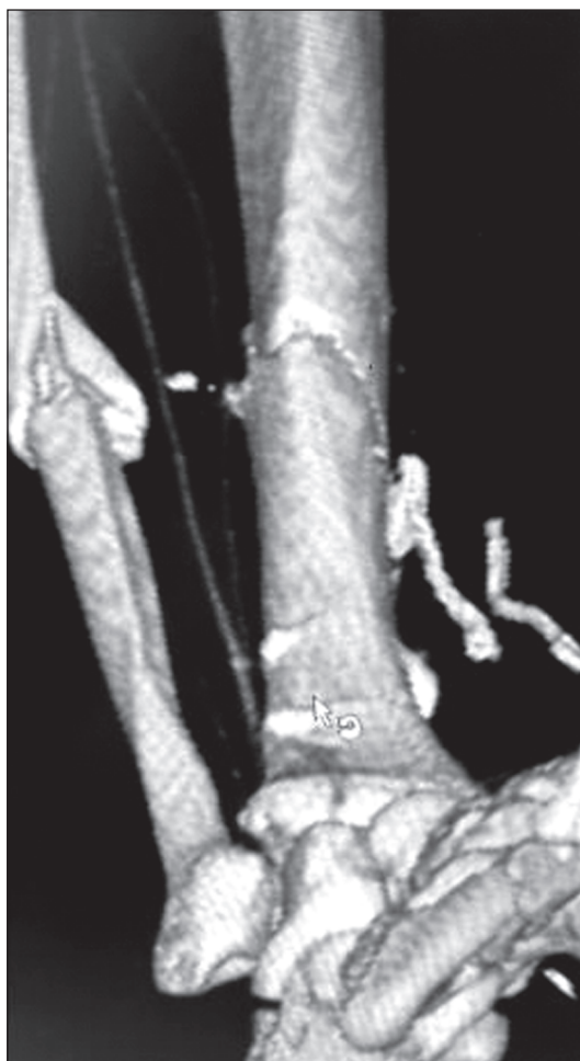
Figure 2. Computed tomography angiography revealed unclear perforation imaging

VWD involves quantitative VWF defects, either partial (type 1 with VWF levels < 50 IU/dL) or almost total (type 3 with undetectable VWF levels), and also qualitative VWF defects (type 2 variants with discrepant antigenic and functional VWF levels) [8]. Diagnostic tests including activated partial thromboplastin time, bleeding time, factor VIII:C Ristocetin cofactor and VWF antigen, can be performed for diagnosis of VWD when this is suspected. Ristocetin-induced platelet adhesion, the multimeric structure and col-